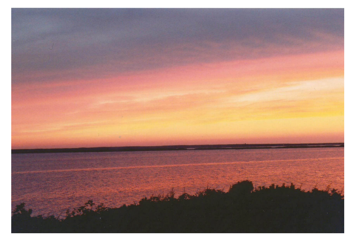
Sunset on Cape Pogue, where I escape to write every summer.

For the last six years I've been fortunate enough to spend a week or two with my family on the isolated northern tip of Chappaquiddick Island (yes, that Chappaquiddick) in a house that until last year had no electricity. We now have lights that come on with the turn of a switch, but still no TV, no video games and no computer. We play board games at night and then each pick our favorite spot on the couch or window seat and read one of the many books we've brought along. During the day I sit on the porch with my narrow-ruled notepad and Pilot pen and write for hours. This summer I continued work on my third book, as yet untitled, about an Italian-American family with a restaurant in Boston's North End. The story—narrated by the matriarch, Rose; her daughter, Toni; and her granddaughter, Vanessa—will span over sixty years in the family's history. It's due to be published by Harlequin in November, 2008.