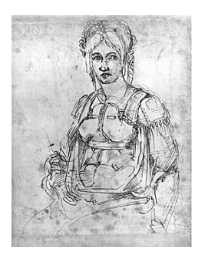
The image above is a drawing of Vittoria Colonna by Michelangelo.

"The artist's hand moved across the page as if in a caress. But instead of stroking my face, he was sketching it.