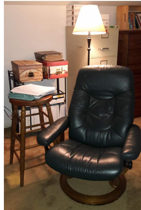
The chair I sit in to write

I couldn't resist noting another resonant passage from History of the Rain to highlight what my challenges have been recently in getting the words on the page for the fourth book in my First Light series. As you know, if you've been reading my newsletter, this book will be Izzy's story. Getting myself into this chair has been daunting, but on the days that I do, I have what the narrator of History of the Rain calls "liftoff."